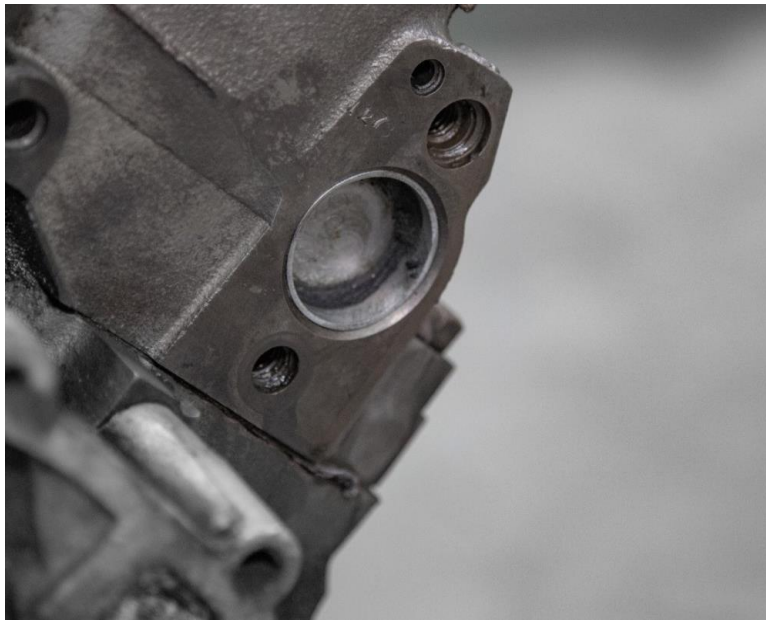
Figure 1: OEM accessory bolt hole locations.

NOTE: The bracket has two upper holes. Vehicles without A/C may use the inner hole to mount the pump closer to the motor.