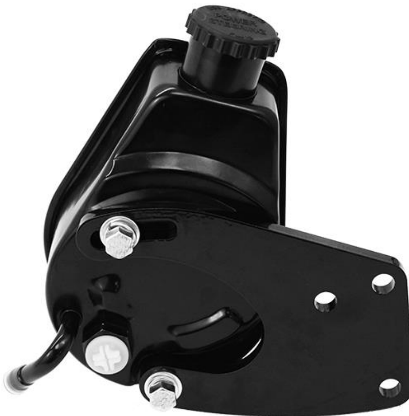
Figure 3: Installing the power steering pump to the bracket.